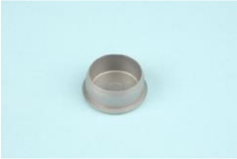
Plug silvergrey 28 mm