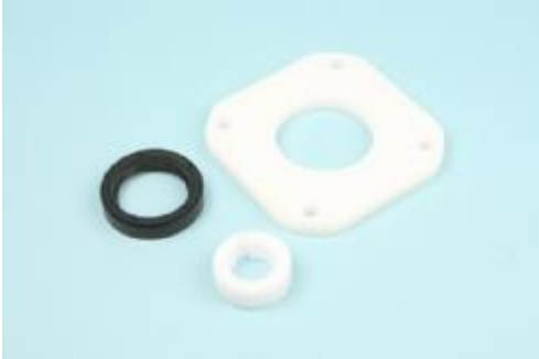
Gasket fitting for motor