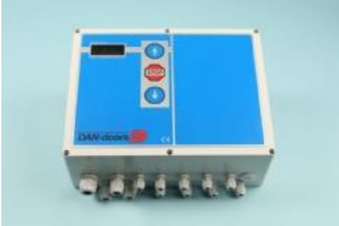
Control unit type SCD 750 W 1 & 2 leaf