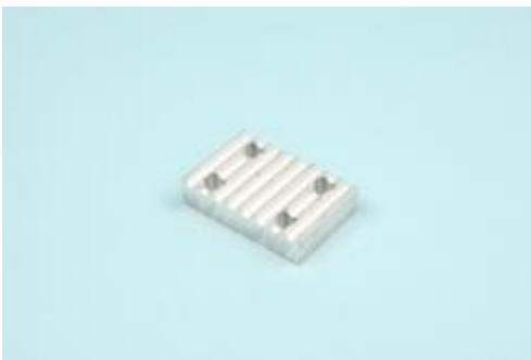
Connection for tooth belt