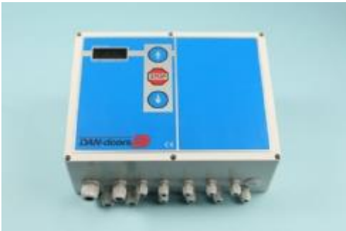
Control unit type SCD1500W