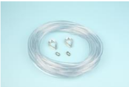
2 nos. pull cords